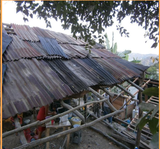
Before and after, the slats on the right are ready for the lamina sheeting