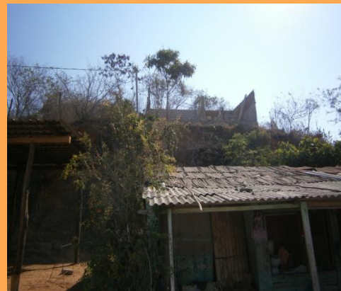
Old house below and new one up above

† Thank you to the Kids Helping Kids Ministry from Vernon, B.C. who provided enough funding for us to replace two roofs in a very poor community above Zihuatanejo. They made things to sell and had a garage sale last summer. God bless you!!